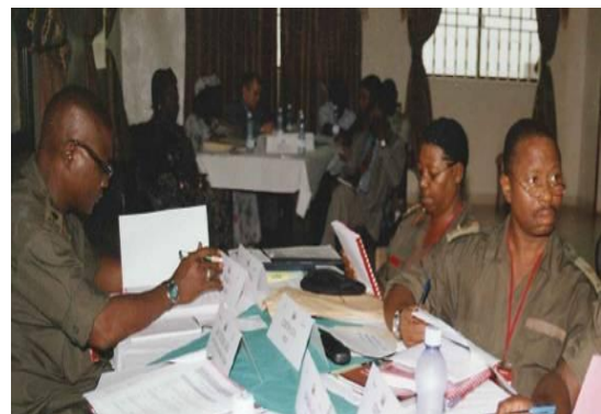
Working group sessions during gender awareness seminar

The Geneva Centre for the Democratic Control of Armed Forces (DCAF) and WIPSEN-Africa organised a Gender Awareness Seminar for the Senior Management of the Ministry of Defence and Republic of Sierra Leone Armed Forces from 22-23 July 2009 in Freetown, Sierra Leone. At the request of the Ministry of Defence, this two-day training focused on gender and defence issues including integrating gender into defence white papers and developing institutional gender policies.