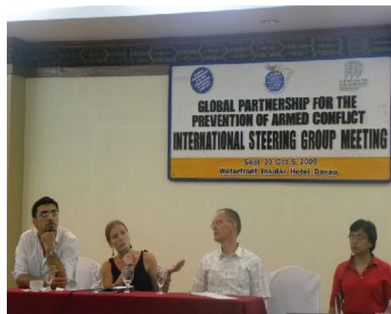
GPPAC Programme Managers presenting their activities to the members

The formulation of the activities during