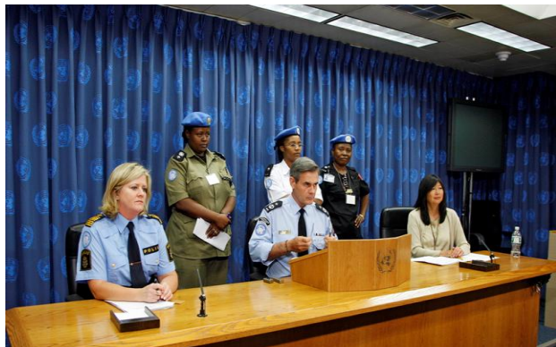
Three female UNPOL officers who currently serve in peace operation missions stand at a press conference for the Resolution 1820 Open Debate in New York.

The Pearson Peacekeeping Centre (PPC) played a key role in bringing three female United Nations Police (UNPOL) officers to the Security Council open-debate on UNSCR 1820 in New York, in early August 2009.