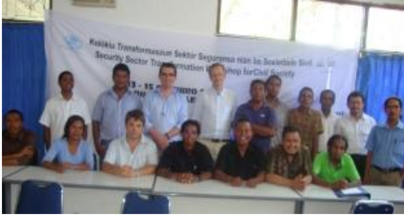
Civil society representatives at the Timorese training

The workshop attained a positive level of official recognition and participation with both the Secretary of State for Defence and the President of the Parliamentary Committee on National Security Defence and Foreign Affairs attending parts of the event. The key objective of the workshop was to raise basic awareness of the role that civil society could play in what is