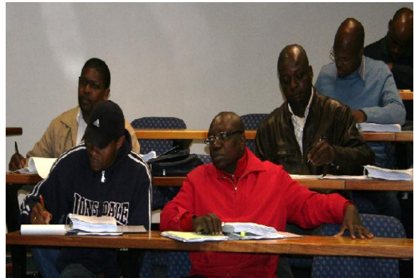
Wits University participants in the newly-launched postgraduate diploma in Security

The aim is to build in-house capacity for the deepening of required skills to govern and manage the security sector of countries in the region more effectively and efficiently. The next intake of students will be in January 2010.