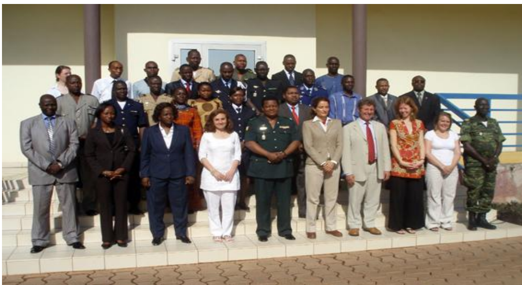
African Peacebuilding Training Course 2009 participants

The GCSP conducts the African Peacebuilding Training Course on behalf of the Swiss Federal Department of Foreign Affairs (FDFA) and in partnership with EMP. The EMP is a centre of excellence in Africa contributing to capacity-building in peace and security in African states.