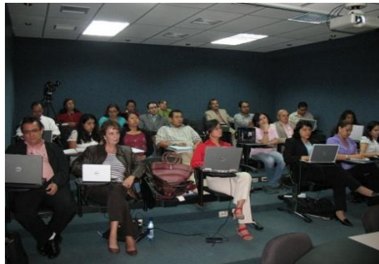
Participants at the Police Reform Training

The contribution of the Teaching Institute for Sustainable Development (IEPADES) to Security Sector Reform in Guatemala and the region, has focused on capacity building and the inclusion of social actors. It is hoped that the collective dialogue that results from IEPADES' activities will lead to policy proposals that guarantee human rights and civilian participation in security matters.