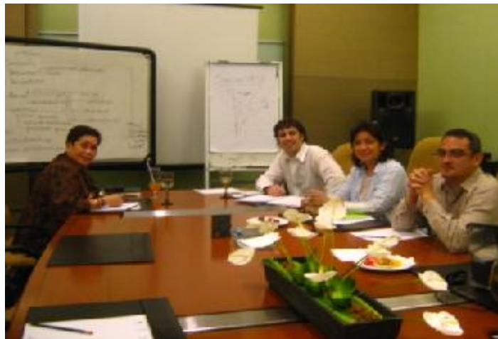
Participants discuss implementation of WGRS project

out by the regional teams. The goal was to set the timetable and deliverables, as well as to have an agreement on the template that will be used for the regional study paper in order to facilitate comparison.