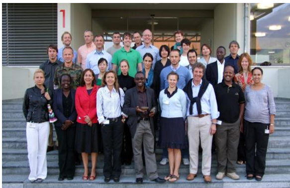
The 10th Swiss Peacebuilding Training Course Group photo.

From 30 August to 11 September 2009, the Geneva Centre for Security Policy (GCSP) organised its 10th Swiss Peacebuilding Training Course in Stans, Switzerland, the home of the Swiss Armed Forces International Command