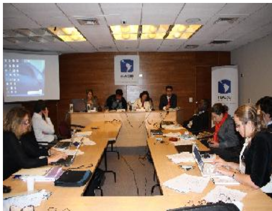
Participants at the Police Reform Training

This workshop was the first international activity of the Global Consortium on Security Transformation's (GCST) Working Group on Prevention of Crime and Community Participation. The workshop was held in Santiago, Chile from 21-22 October 2009 and aimed to present and analyse the first steps towards the institutionalisation and implementation of mechanisms for crime prevention in different regional contexts. The meeting was organised by The Latin American Faculty of Social Science (FLACSO), Chile.